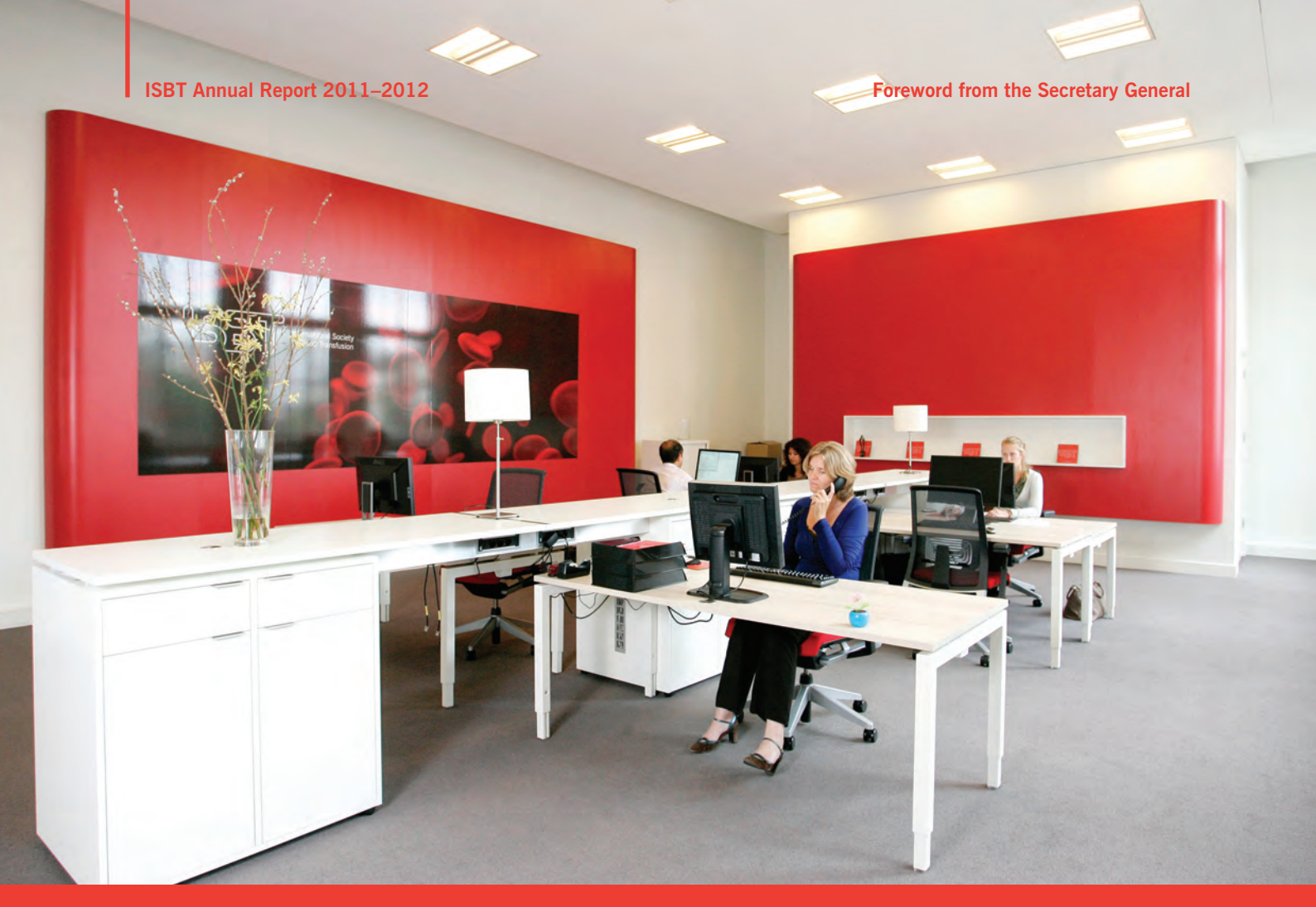
New ISBT Office