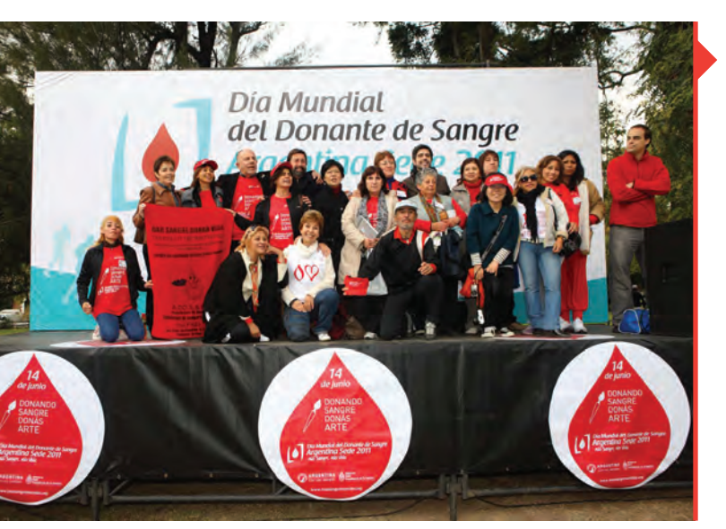
WBDD Argentina 2011

The National Blood Program (NBP) was created in 2002 with the following aims: to promote voluntary and repeated blood donation, to strengthen the work in scale in preparation blood product and to promote the appropriate use of blood components.