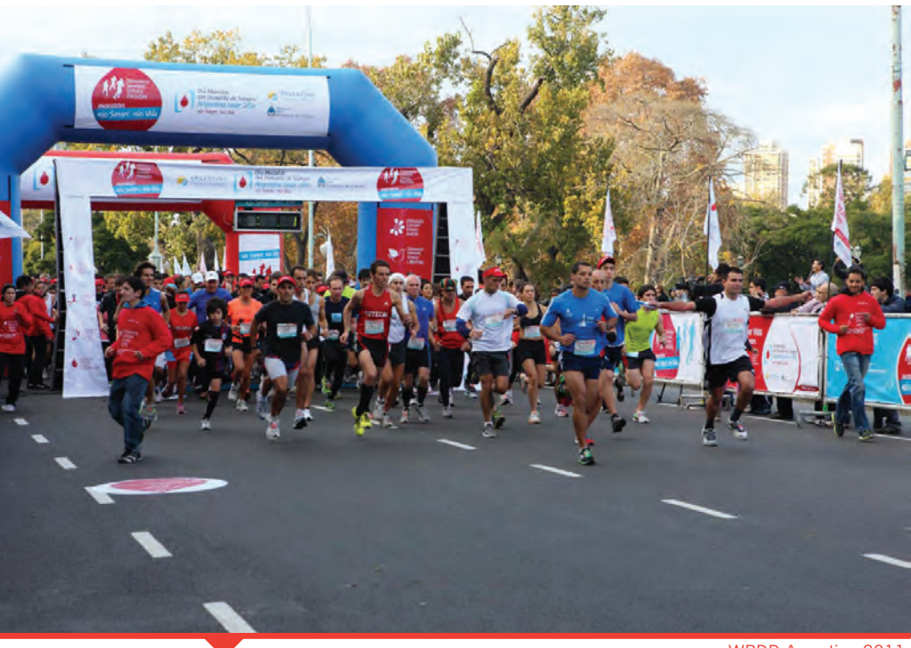
WBDD Argentina 2011

The National Blood Program (NBP) was created in 2002 with the following aims: to promote voluntary and repeated blood donation, to strengthen the work in scale in preparation blood product and to promote the appropriate use of blood components.